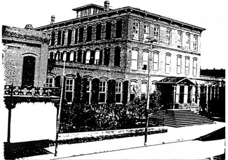
The pleasant, redbrick cigar factory that Don Vicente Martinez Ybor built in Tampa, Florida.

Most of the workers spoke Spanish (and if they didn't, they soon learned that language). In the cigar factories the reader, who was called a lector , read in Spanish as workers rolled the fat cigars. It was a prestige job. The lectors were paid by the workers and made more money than any of the cigarmakers. They auditioned for the job, which means they had to try out the way an actor auditions for a play. Sometimes a committee of cigarmakers told them what to read. Usually that included the latest news and good books. The cigarmakers became very knowledgeable. While they rolled cigars they held discussions. They kept up with politics and, since many were Cuban, they worried and even got involved with what was happening in Cuba. A freedom movement was brewing on that island (more on that in chapter 29).